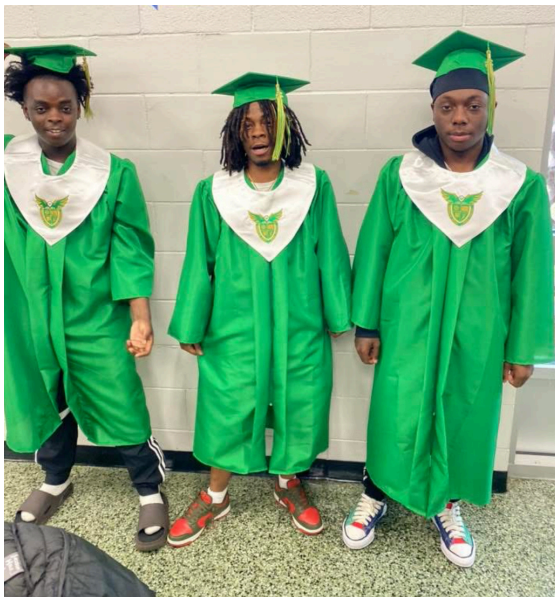
Senior pride on full display - our young men suit up in their caps and gowns, ready to walk into the future!

Amid the end-of-year excitement, our dedicated administrators are taking time to celebrate the heart of our school—our teachers—during Teacher Appreciation Week. So far, staff have enjoyed tacos and slushies on Monday, followed by signature Josey glassware and a Chick-fil-A breakfast on Tuesday.