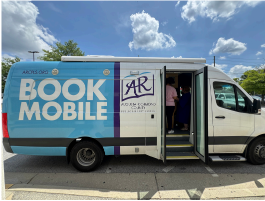
ARCPL Book Mobile arrives at Josey High, delivering books and fostering a passion for reading!